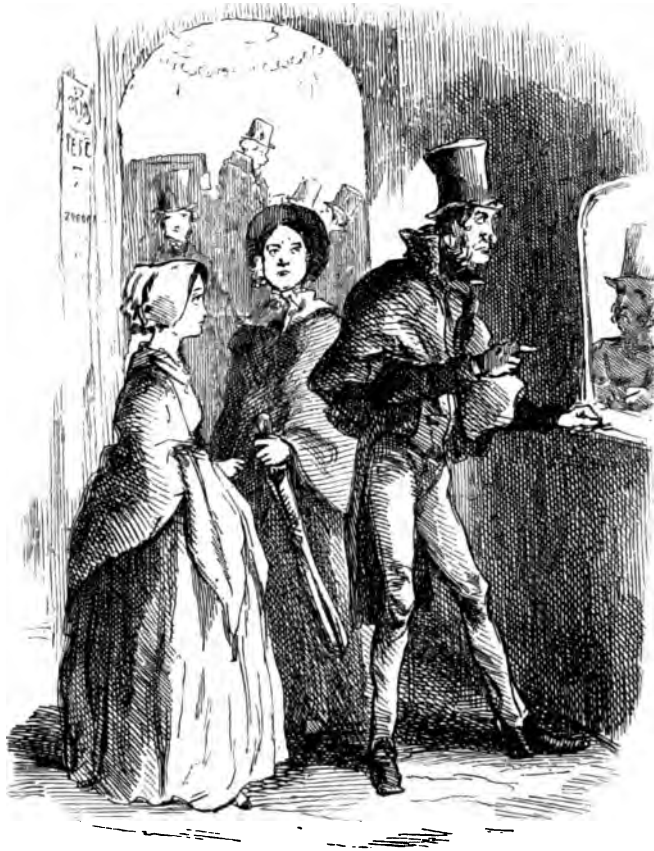
CAPTAIN COSTIGAN IN PERPLEXITY